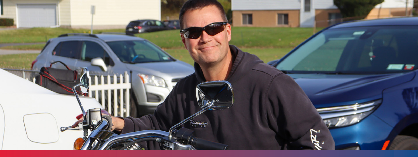
RIDE FOR HOPE: VETERAN WINS DREAM BIKE, COMMUNITY RALLIES FOR VETERAN SUPPORT